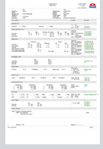
Printout via "EUROSYSTEM" test lanes software.